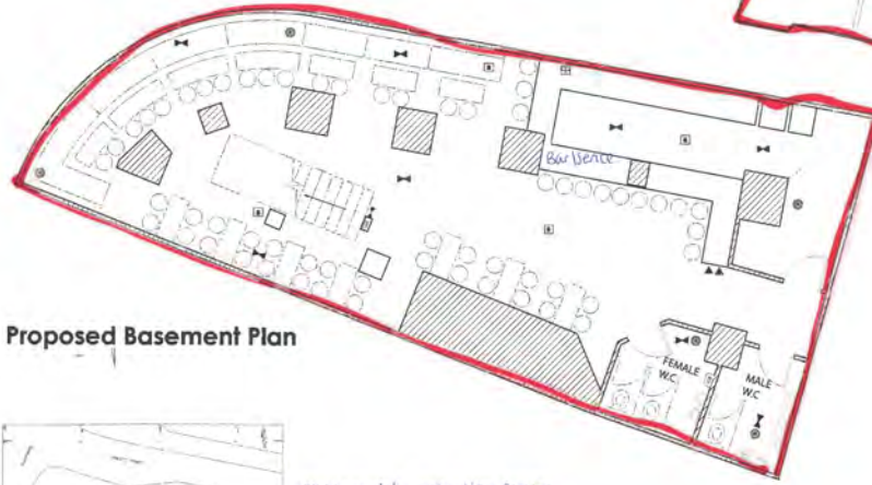
Proposed Basement Plan