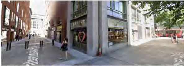
Existing Photos - Pedestrian Street, existing external seating