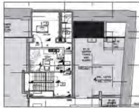
BASEMENT FLOOR SCALE 1:100