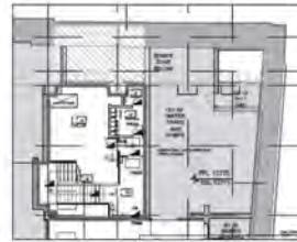
LOWER BASEMENT FLOOR SCALE 1:100