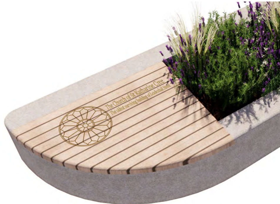
Engraving to timber seating top (inspired by the stained glass window, Church of St Katharine Cree)