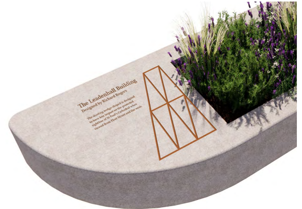
Brass inlays to planter top (illustrating the triangulated forms of the Leadenhall Building's magastucture)