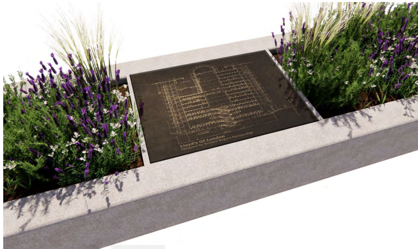
Brass plate etching (illustrating the intricacies of the Lloyd's Building Bowellism architecture)