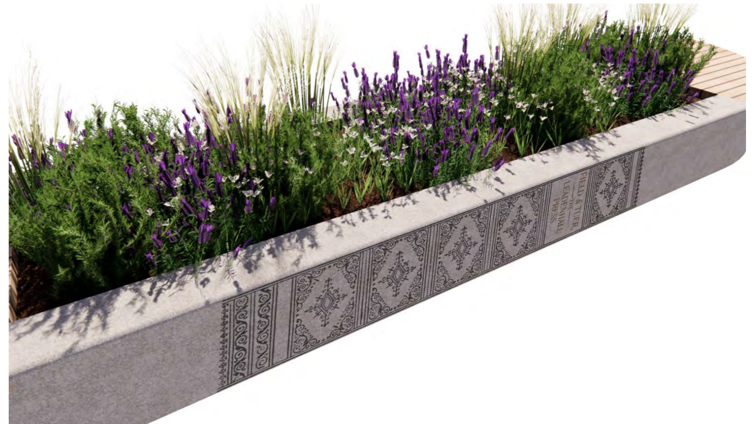
Micro-etching on planter walls (book spine from The Leadenhall Press)