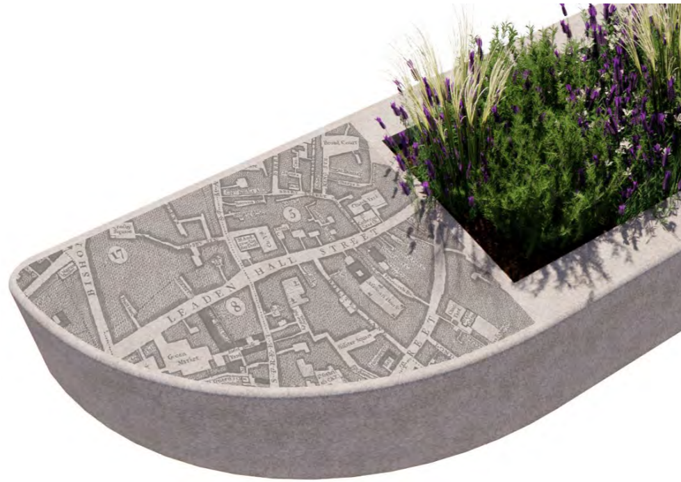
Micro-etching on planter top (map illustrating the historic alleyways of Leadenhall Street)